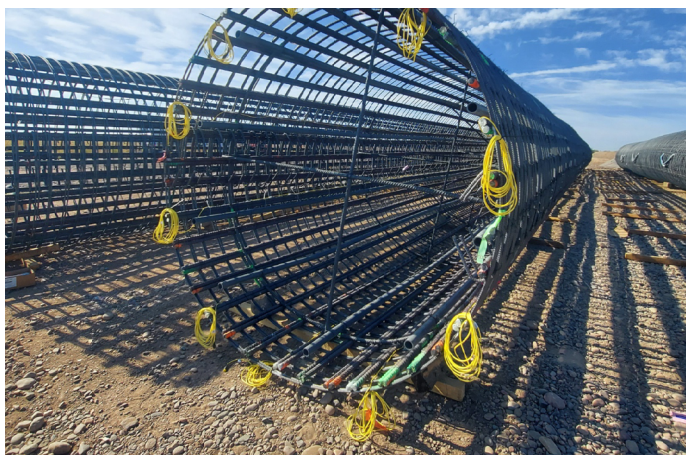
Cage Instrumented with Thermal Wire® Cables

The Gilbert Road bridge project demonstrates the value of advanced integrating testing technologies to help confirm the long-term stability of infrastructure projects. This project proves that proactive quality control measures, combined with experienced contractors, can overcome complex challenges and deliver durable, resilient infrastructure for the community.