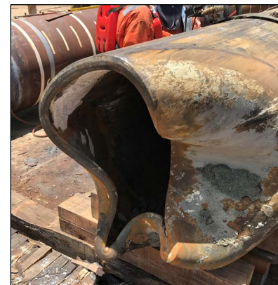
Figure 2. Extracted pile in Case 1, where upon encountering bedrock, eccentric stresses yielded one side of the pile.

42 in (1070mm) O.D. pipe piles were driven into a shallow hard gypsum rock layer on a 1:17 inclination suggesting the piles would experience eccentric forces once bedrock was encountered. All four foundation piles encountered refusal conditions at approximately 16 ft (5m) penetration and pile damage was observed on the first of the four piles driven.