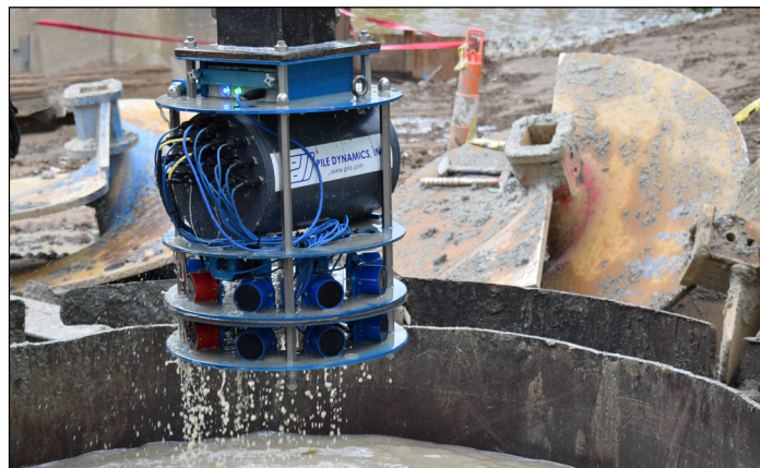
A SHAPE Test Conducted in Slurry

Often, specifications require a survey of the as-built shaft geometry and verticality of a drilled shaft. Without a testing method, the performance of the structure could be compromised. The Shaft Area Profile Evaluator (SHAPE) quickly and easily collects and assesses profile and verticality data from the excavation. The unit is attached to the Kelly bar and then lowered into the water or slurry-filled shaft to identify irregularities that affect shaft performance. The SHAPE ultrasonically scans up to eight channels (at every 45-degree orientation), while being lowered into the excavation. Immediately after exiting the excavation, the unit quickly and wirelessly sends the data to the SHAPE tablet. The tablet can be accessed remotely with SiteLink Technology, which reduces the number of personnel onsite. A SHAPE test does not require personnel to be near the open drilled shaft, and typically takes only minutes to complete. Furthermore, data analysis and automatic features quickly provide the shaft profile and verticality view.