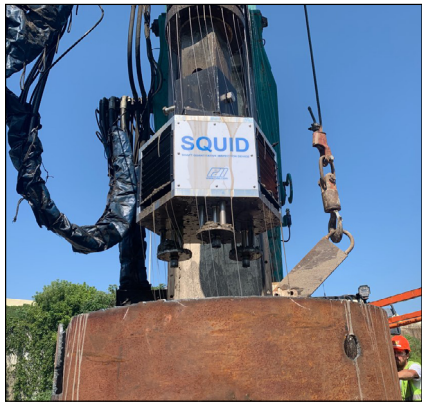
Bottom Cleanliness Evaluation with SQUID

An ongoing Ohio Department of Transportation project, which uses drilled shafts terminated in soil, required that the thickness of debris (disturbed soil and sediment) at the base of the shaft be measured prior to casting concrete. The Shaft Quantitative Inspection Device (SQUID) was proposed to perform the measurements. This project's high production rate lead to the decision that the testing would be performed remotely with the engineer viewing and collecting the data in real time from their office.