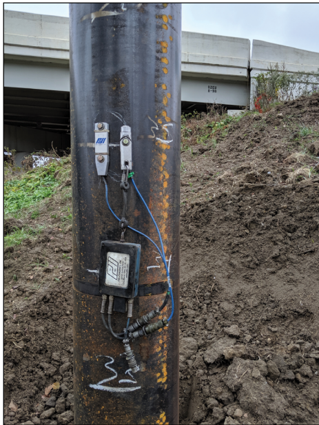
PDI Wireless Sensors

Deep foundation testing is performed during a test program to aid in design, as well as during construction to confirm the