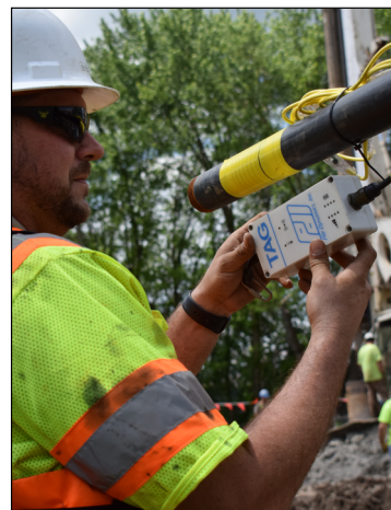
Attaching TAG to Thermal Wire® Cables

Remote Thermal Integrity Profiling allows the engineer to assess integrity issues based on the measured temperatures in the shaft during concrete curing. Within 24-hours of concrete placement an evaluation of the shaft’s integrity and the results are available via the dedicated Cloud server. Remote testing capabilities support continuous construction and allows engineers to assess the integrity of drilled shafts without encountering onsite personnel. (article continues on next page)