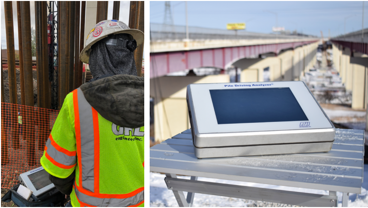
GRL Engineer testing the Valley View Bridge using the Pile Driving Analyzer® (PDA)

The addition of a third structure, between the two existing bridge structures, carrying I-480 over the Cuyahoga River Valley near Cleveland, Ohio, required high pier loads and very deep foundations. The design-build team on the Valley View Bridge Project opted to perform an extensive design-phase pile load test program to take advantage of the incredible amount of soil set-up available in the generally silty-clay soils of the Cuyahoga River Valley. The test program included the installation of 24, 18" (457mm) diameter closed ended pipe piles, each of which would receive short and long term restrikes. Long term restrikes, typically between 36 and 57 days after driving, were performed using GRL's 28 ton APPLE drop hammer. In addition, three static load tests were performed. The 1000 ton static load tests included 12 to 15 embedded strain gages to evaluate the load transfer along the length of the piles. GRL was contracted to perform the dynamic and static load testing, design the instrumentation for the static load test, and evaluate the data.