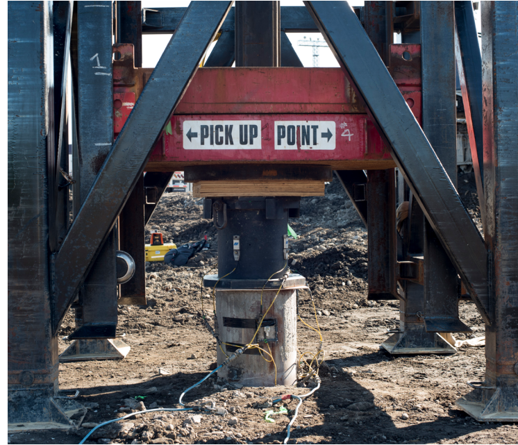
GRL's APPLE system and force transducer being used to perform a dynamic load test

While the Pile Driving Analyzer® (PDA) has been used to collect and analyze data on different drilled foundations (drilled shafts/ bored piles, ACIP/CFA piles, helical piles, etc.), the PDA software has until recently been optimized to analyze driven pile foundations. Last year however, Pile Dynamics, Inc. released the Pile Dynamics Analyzer – Dynamic Load Tester (PDA-DLT) system and associated software, which is specifically designed for high strain dynamic testing of drilled pile foundations. The PDA-DLT allows for multiple configurations of force measurement (such as a force transducer), while evaluating bearing capacity, structural integrity, foundation stresses, and tabulates data over the few blows applied to a drilled foundation.